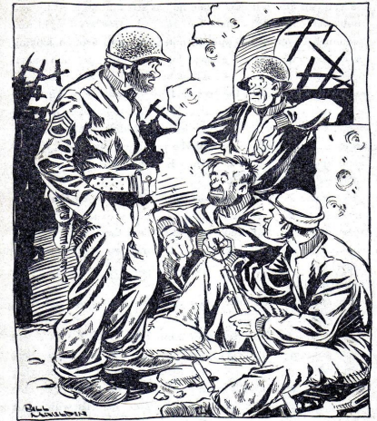
"I need a couple guys what don't owe me no money for a little routine patrol."

Edwin E. "Buzz" Aldrin supposedly brought a Masonic flag to the Moon in 1969. Aldrin, a member of Clear Lake Lodge in Texas, is even rumored to have carried a special deputation from the Texas Grand Master, claiming the Moon as a territorial jurisdiction of the Grand Lodge of Texas.